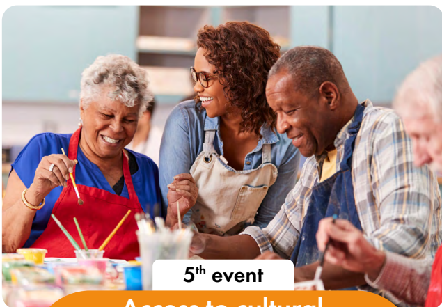
5 th event

Access to cultural and leisure activities: Tackling Individual interests and inter-generational social construction