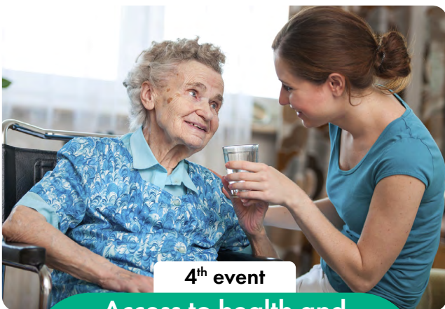
4 th event

Access to health and social care services: Further vulnerabilities merging from ageing